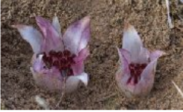
Rhizanthella gardneri is a cute, quirky and critically endangered orchid that lives all of its life underground.