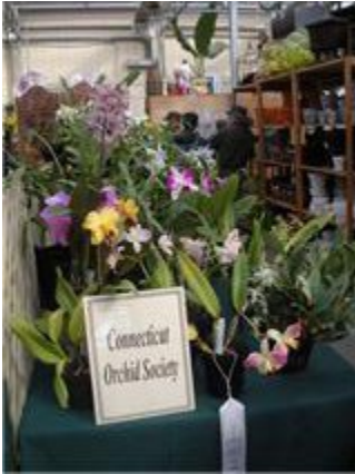
2011 Connecticut Flower Show results

Van Wilgen's Garden Center "Escape to Spring", Mar. 11 — 13, 8:00—5:00, 51 Valley Rd., North Branford, CT ~ Volunteers are needed to man our booth and hand out brochures. We will be holding instant raffles at this event.