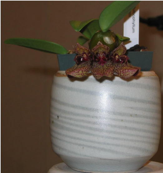
Bulbophyllum frostii This sweet little orchid was brought to the Show Table by Debbie Landrey.