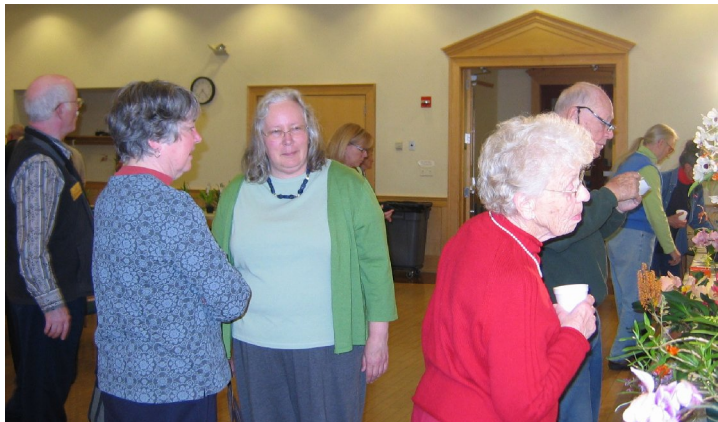
On right: members chatted and reviewed the Show Table before the meeting started.